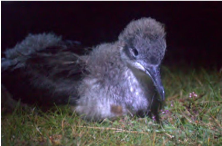
Manx Shearwater fledgling outside burrow at Wingletang, St. Agnes (Nick Tomalin)

The Isles of Scilly Seabird Recovery Project is protecting seabirds by keeping the islands of St. Agnes and Gugh 'rat-free'. This is the largest community rat-removal project in the world to date, with a resident population of 84 people. The Isles of Scilly have 20,000 breeding pairs of 14 different species of seabirds, but many are declining. Among many challenges our seabirds face, the greatest threat on land is predation of eggs and chicks by introduced Brown Rats. Two species of seabirds in Scilly are at greatest risk from rats – European Storm Petrels ( Hydrobates pelagicus ) and Manx Shearwaters ( Puffinus puffinus ), and within two years