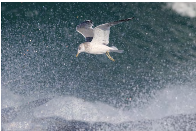
Kamchatka Gull at Gangneung, South Korea