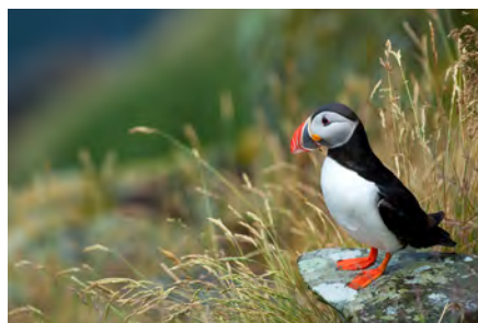
L to R: European Shag, Kittiwake (both Fair Isle, Shetland, UK), and Atlantic Puffin at Runde, Norway.