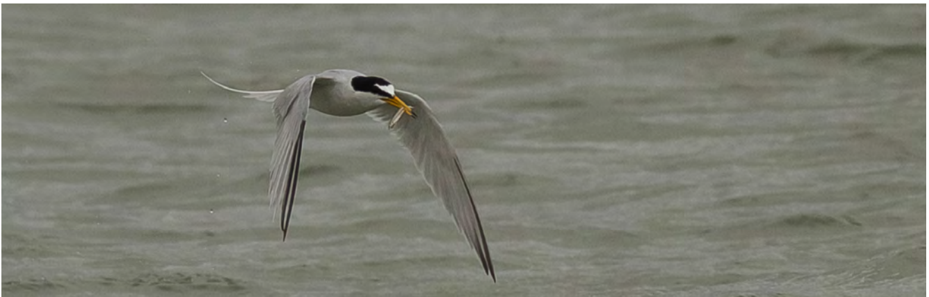
Little Tern carrying a fish, Rye Harbour (Lewis Yates)

Many thanks to the Seabird Group for supporting this project through their grants program.