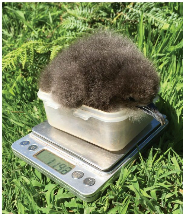
Plate 1. A Manx Shearwater Puffinus puffinus chick being weighed on Skomer Island, Wales.

may be contributing to the global decline of seabirds, a decline which is occurring more quickly than in any other bird group (Lavers et al. 2014).