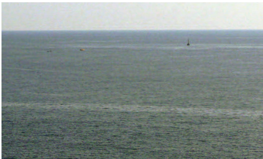
Figure 4. Ephemeral surface slicks (driven by wind and/or tide) over Runnelstone Reef, October 2009. The slick close to Runnelstone Buoy is probably related to flow interactions with the reef margin, but the closer feature is not linked to any obvious topographic feature.

Grey Phalaropes have previously been observed feeding in association with a range of cetacean and seabird species at sea during the inter-breeding period (e.g. Obst & Hunt 1990; Grebmeier & Harrison 1992), and a variety of seabird species have been seen foraging in association with Basking Sharks (Bruce 1952; Angles 1966). However, published observations of Grey Phalaropes associating with Basking Sharks appear to be lacking. In the example presented here, we suggest that Grey Phalaropes were initially attracted to visual manifestations of upwellings and convergence zones over and adjacent to a tidal-topographic front (with enhanced surficial prey availability), and the birds then opportunistically used the tall dorsal fins of foraging Basking Sharks as a visual cue to home in on particularly dense prey patches. The observations documented here were the only times this specific interaction was observed during the five-year 'SeaWatch SW' survey (covering ~5,000 h), and was presumably due to a weather-driven influx of Grey Phalaropes into southwest UK coastal waters coinciding with a rather late influx of surface-feeding Basking Sharks (Wynn & Brereton 2009).