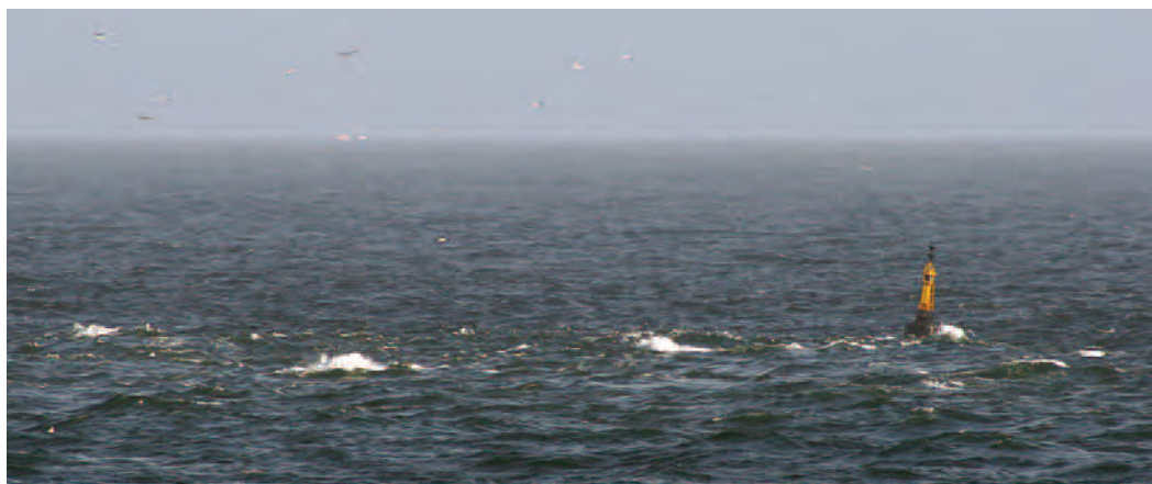
Figure 3. Rough water associated with tidal-topographic interactions at the margins of Runnelstone Reef, July 2009. The strip of rough water represents an area where strong tidal flows interact with upstanding pinnacles ~1.5 km offshore, marked by the location of the Runnelstone Buoy. A loose aggregation of Northern Gannets Morus bassanus is just visible over the zone of disturbed water.

The presence of surface-feeding Basking Sharks is a good indicator for elevated levels of zooplankton prey in surface waters, particularly calanoid copepods (Sims & Quayle 1998; Sims 2008). More than half of the observations of feeding associations between sharks and phalaropes presented here were at ~1.4–1.6 km range, which is consistent with a visible tidal-topographic front located about 1.5 km offshore where strong tidal flows interact with a series of upstanding pinnacles and the steep margins of a rocky platform (Figures 1 & 3). This frontal boundary is a known hotspot for marine megavertebrates (Jones 2012), and is a focus for ongoing research. Basking Sharks (with accompanying phalaropes) were also observed following ephemeral wind- or tide-driven surface slicks and foam lines (Figure 4), inshore and offshore of the reef margin (consistent with observations of Briggs et al. (1984), Brown & Gaskin (1988) and DiGiacomo et al. (2002)). Associations between the two species were recorded in a range of sea states, from 2–6 (i.e. wave heights up to 4–6 m). Basking Shark dorsal fins are up to 2 m high (Figure 2), so even in relatively rough conditions they are likely to be visible to phalaropes in flight or sitting on the sea surface.