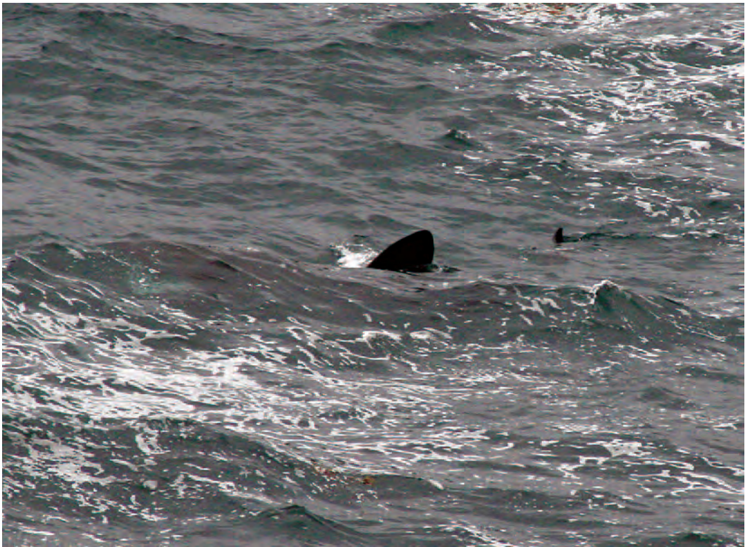
Figure 2. Basking Shark Cetorhinus maximus surface-feeding along a foam line off Gwennap Head, July 2009. The white insides to the open mouth are just visible, indicating the animal is actively feeding. Note the tall, prominent dorsal fin.

No feeding aggregations of phalaropes were noted on 9 October, but on 10 October four birds were seen offshore at 15.48 h increasing to 25 by 16.12 h at ~1.6 km range. A surface-feeding Basking Shark then appeared closer inshore at ~0.8 km range, and from 17.05–17.15 h it was closely followed by a group of six phalaropes. The closer range enabled confirmation that both the phalaropes and the shark were actively foraging, the latter because the open mouth was visible (c.f. Figure 2). The shark's dorsal fin occasionally dipped below the surface and would then re-appear a few metres away, at which point the phalaropes would immediately fly over to rejoin it and continue feeding alongside. Although up to eight phalaropes and three sharks were seen on 11 October, no further interactions between the two species were observed.