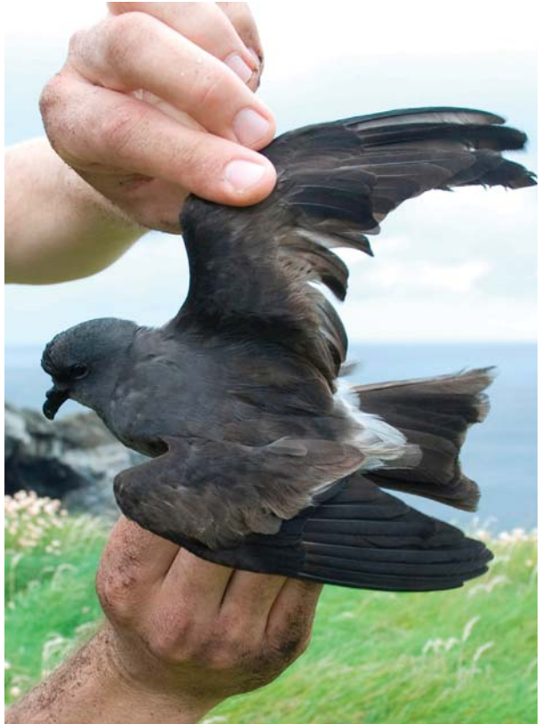
Figure 4. Leach's Storm-petrel Oceanodroma leucorhoa and ungrazed, maritime grassland breeding habitat, Gloup Holm, Shetland, August 2010.