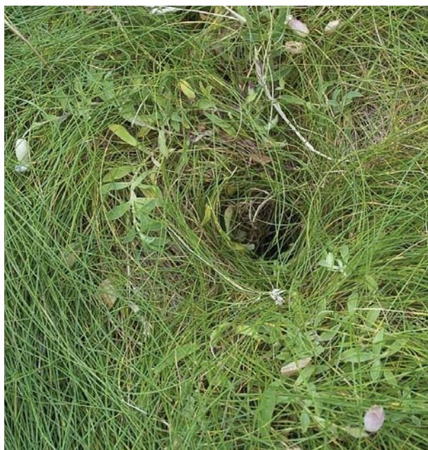
Figure 3. Entrance of a Leach's Storm-petrel Oceanodroma leucorhoa burrow, Gloop Holm, Shetland, August 2010.