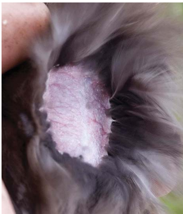
Figure 2. Leach's Storm-petrel Oceanodroma leucorhoa brood patch, entirely bare of feathering and highly vascularised, Gloop Holm, Shetland, August 2010.